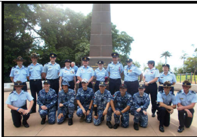
RAAF regulars and cadets who were involved in the ceremony