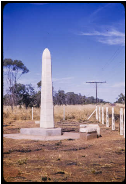
The memorial before

To me it is a shadow of its former self. As part of the 150th commemoration of the opening of the line in 2022, it would be nice to clear up a few mysteries. Where did the marble go? Who took it and why? Can anyone help?