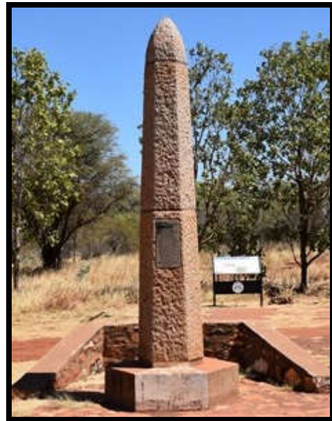
The memorial now