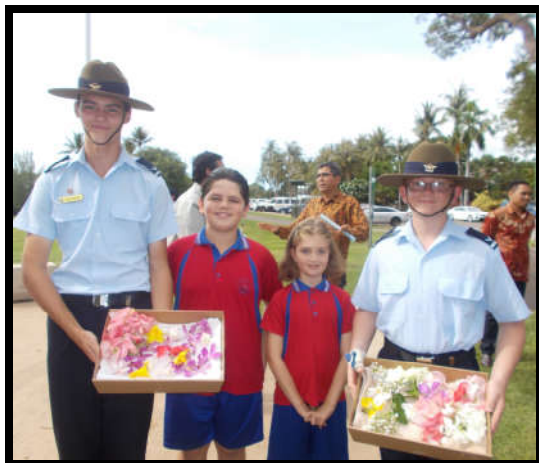
RAAF cadets & Parap Primary School Children